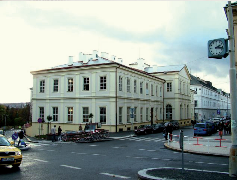
U nemocnice 497/4, 128 00 Praha 2-Nové Město