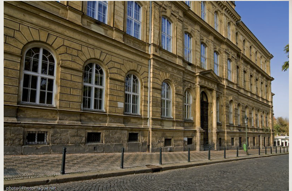
Viničná 1594/7, 128 00 Praha 2-Nové Město

Maps available at: https://sites.google.com/a/natur.cuni.cz/building_anthropology/premises